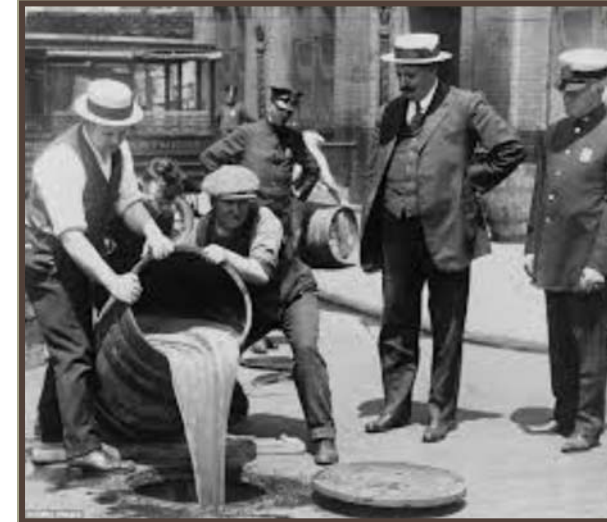
Alcohol is poured down the sewers during prohibition days in the United States (1920-1933) Unknown City