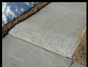
Right: Example of repaired trip hazard.