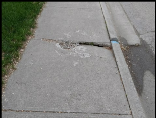
Example of a Hazardous Sidewalk.

You may receive communication from the City if your property has been identified as needing sidewalk repair or construction.